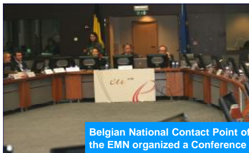
Belgian National Contact Point of the EMN organized a Conference

The EMN, which undertakes the analysis of data and information, has an important role to play in contributing to the further development of better European migratory statistics and supporting policymaking in the European Union in these areas.