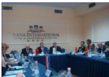
MARRI Regional Forum under the Albanian Presidency-in Office

Tirana, Albania – MARRI Regional Forum under the Albanian Presidency-in Office took place on 06&07 December 2010, in Tirana, Albania. The Forum provided an opportunity for MARRI