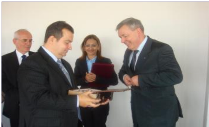
First Deputy Prime Minister and Minister of Internal Affairs of the Republic of Serbia, Mr. Ivica Dačić, together with his counterpart from the Republic of Macedonia, Ms. Gordana Jankuloska, paid a visit to the MARRI Regional Centre

He stressed the strong support of the Republic of Serbia for the MARRI Regional Centre in particular, and for the regional cooperation, in general, and mentioned the importance of MARRI Initiative in the