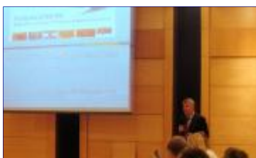
MARRI RC—On screen presentation

Also, this conference was used for sharing information between MARRI and FRONTEx representatives on the common approach in promoting the mutual work on the Western Balkans.