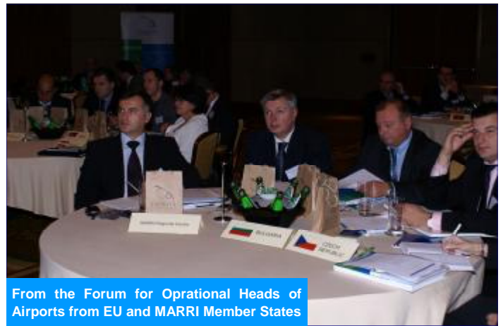
From the Forum for Operational Heads of Airports from EU and MARRI Member States

nders of main international airports from MARRI Member States established in the frame of the Project "Establishment of network for cooperation between border police on international airport border crossing points in MARRI Member States" implemented by MARRI Regional Centre was introduced. Its Members had the opportunity to present border police on international airport border crossing points in their respective countries, to share their experience and to interact with their colleagues from EU Member States.