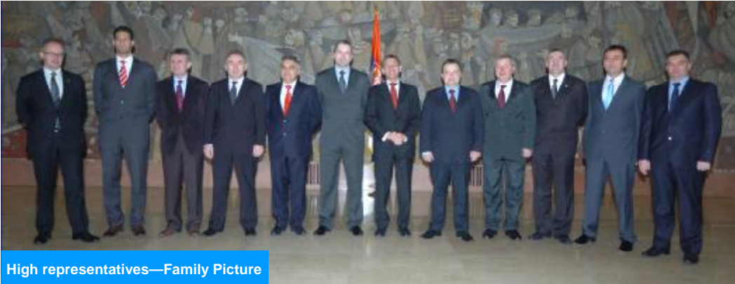
High representatives—Family Picture

On 20 & 21 December 2010 in Belgrade, Serbia the Ceremony of signing of Memorandum of Understanding on Sustainability of Established Co-operation Network between Border Police Units on International Airport Border Crossing Points in MARRI Member States took place.