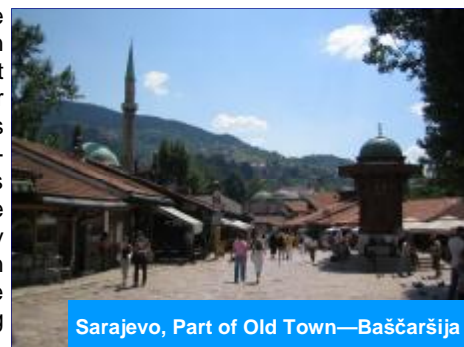
Sarajevo, Part of Old Town—Baščaršija

in the field of Justice and Home affairs on SEE. The Draft Strategy Paper for 2011 – 2013 was reviewed, and further progress was achieved. The Regional Strategy and the Action Plan is expected to be operational starting from January, 2011.