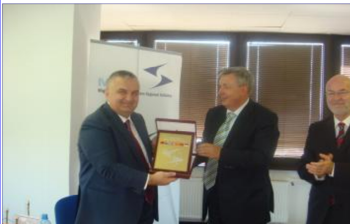
Mr. Ilir Meta, visited the MARRI RC, on 29 July 2010, within the framework of his official visit to the Republic of Macedonia